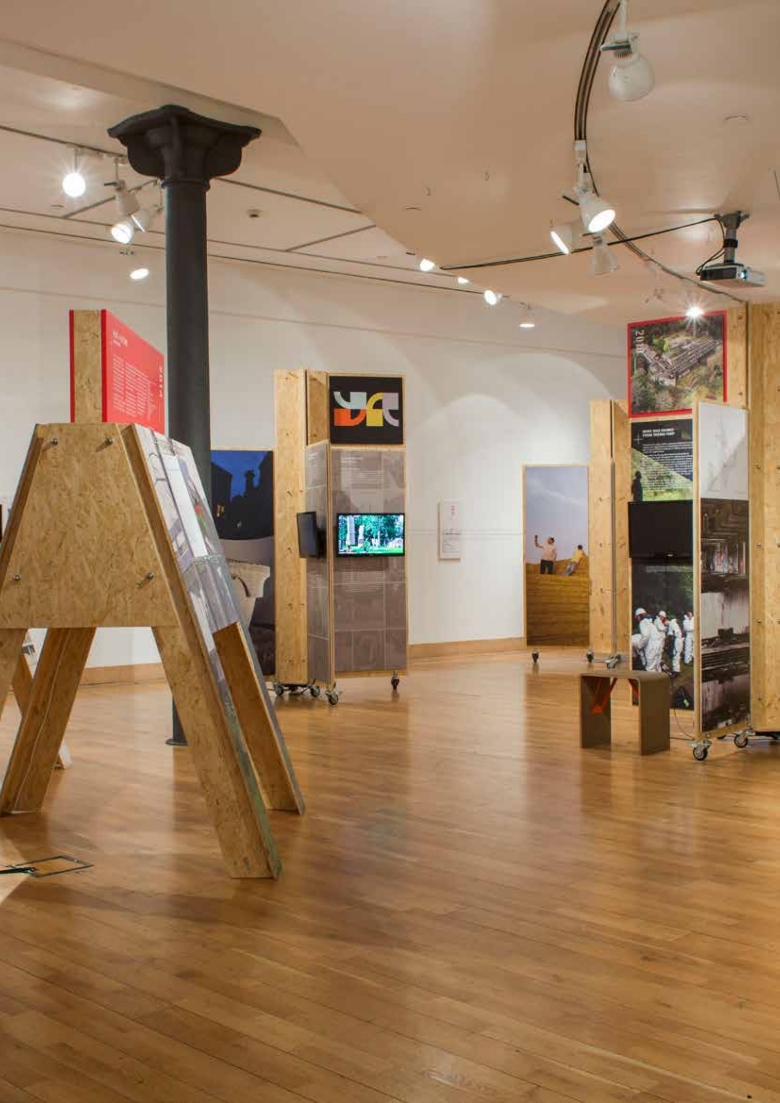
< Scotland + Venice exhibition re-presented Scotland's contribution to the Venice Architecture Biennale 2004-2014.