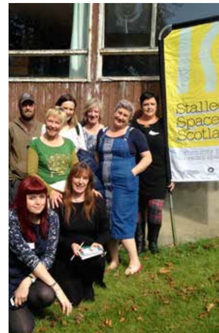
< Stalled Spaces Scotland event.

Stalled Spaces Scotland projects with workshops on funding, growing skills and digital/social media skills.