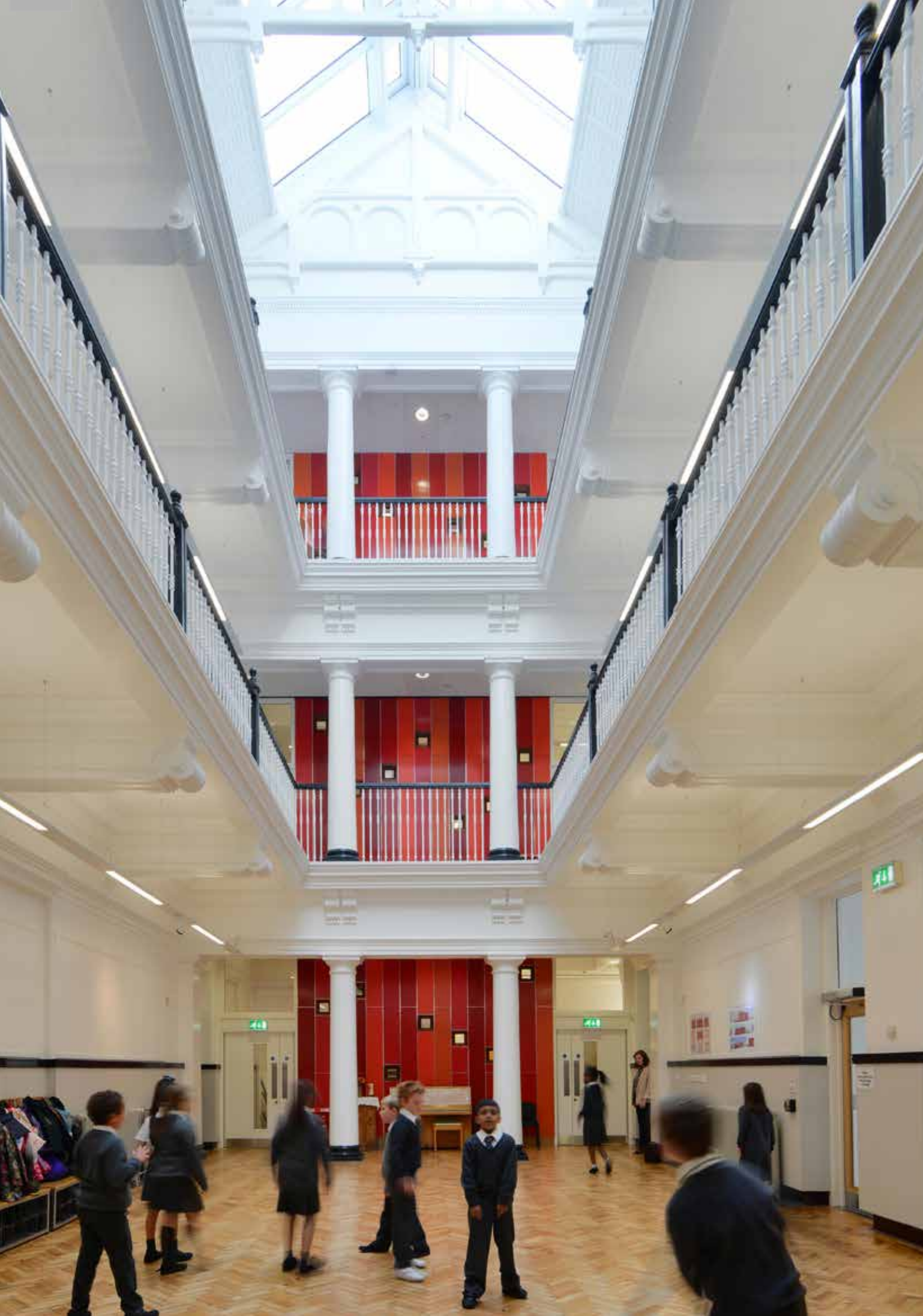
< Notre Dame Primary School, Glasgow, featured in the Why Refurbish? Guide.