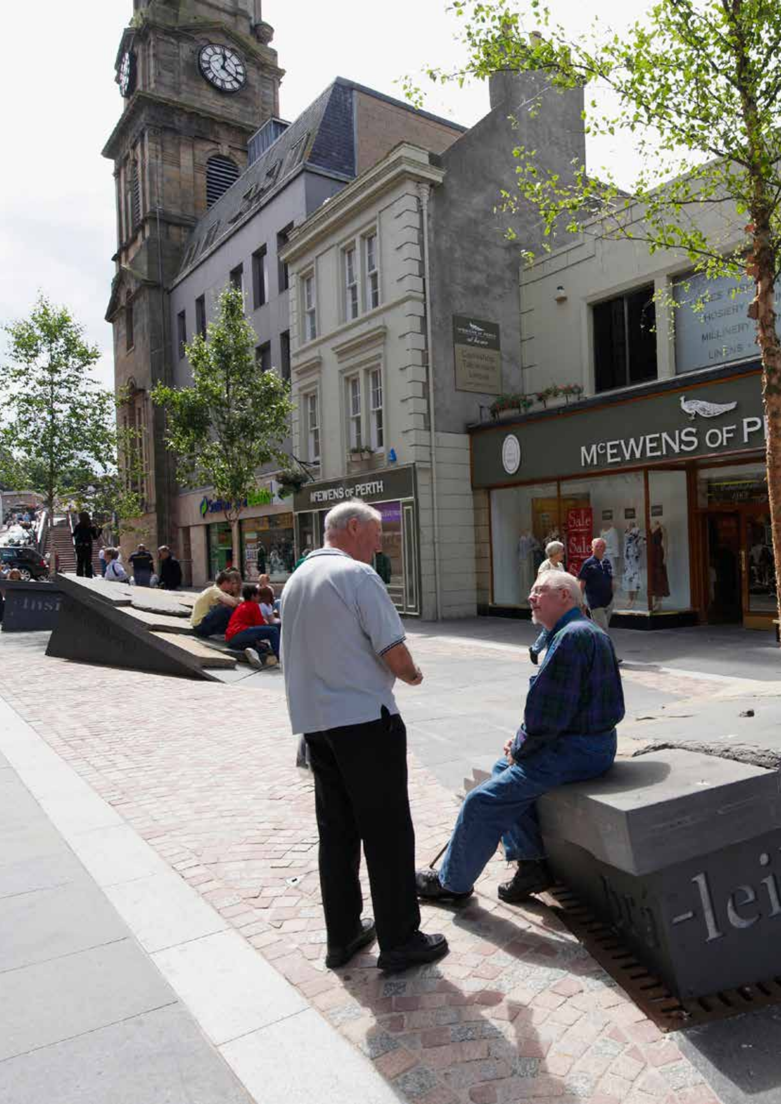
< Inverness - The Three Virtues.