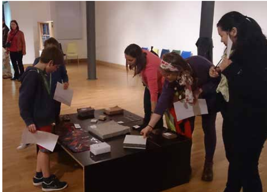
< Learning about materials during Doors Open Day at The Lighthouse.