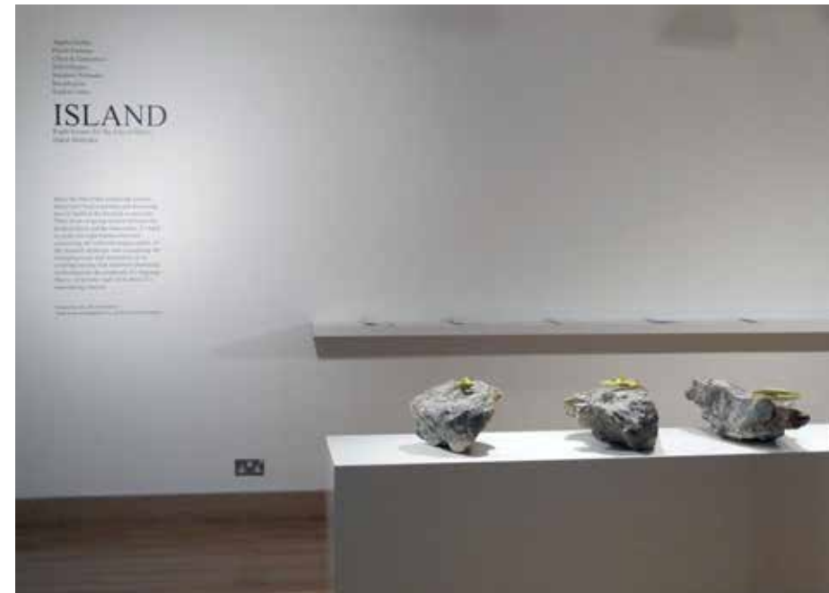
^ Island Exhibition